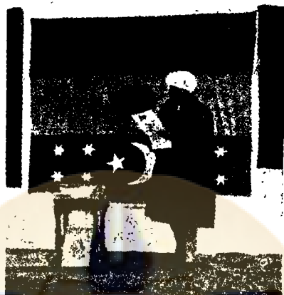
Mahendra Pratap before the flag of the Provisional Government of Free India at Kabul, in December 1915.