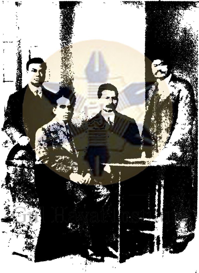
(from left to right) 1. Champak Raman Pillai; 2. V. D. Savarkar; 3. V. Chattopadhyaya (probably); and 4. an unidentified revolutionary.