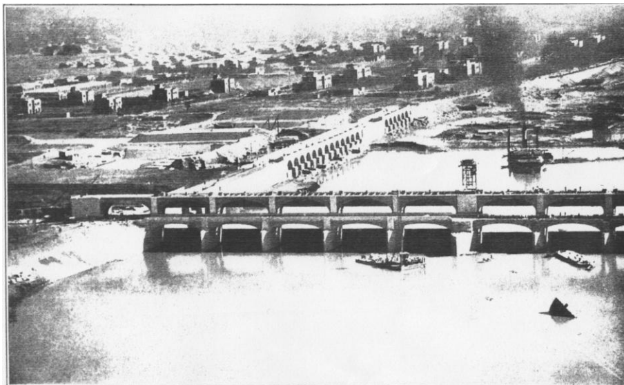
‘View of barrage, canal head regulators and township on right bank’, N.a., The Opening of The Lloyd Barrage and Canals by His Excellency The Earl of Willingdon, G.M.S.I., G.C.M.G., G.M.I.E., G.B.E., Viceroy and Governor General of India on Wednesday, the 13th January 1932 (Bombay: Government Central Press, [1932?]), p.4, in Dow Papers, Mss Eur E 372/2, B.L.