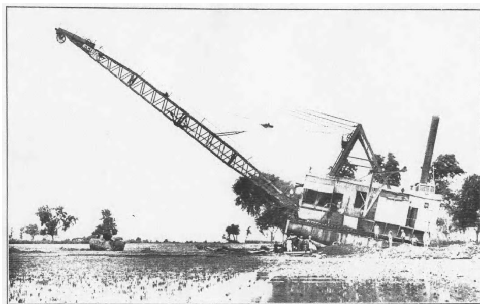
“Jacob Bahadur” excavator – general view showing the rear part of machine sunk in a dhoro near Pitpikar on the 24 th July 1929’, N.a., The Opening of The Lloyd Barrage and Canals , p.11.